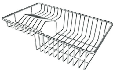
Stainless steel plate rack 8100 303 * only in combination with the accessory 8644 101