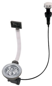
Automatic waste fitting 8407 000