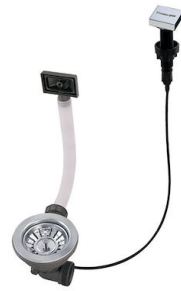
LIRA automatic waste fitting 8407 102